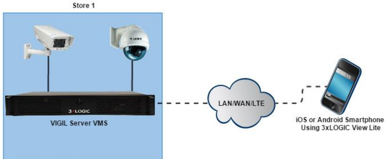
Figure 1-3 3xLOGIC View Lite Smartphone App Connection Topology

With the exponential growth of wireless and mobile capability, the potential for instant and direct access to your security network via a mobile device has become reality. Welcome to 3xLOGIC's View Lite II Smart Device application, a new solution to your mobile video surveillance and management needs.